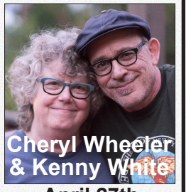
February 10th April 27th SAVE THE DATES!

All EC-CHAP Articles are now available on our website: