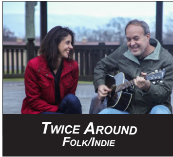
TWICE AROUND FOLK/INDIE