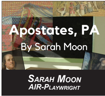
Apostates, PA