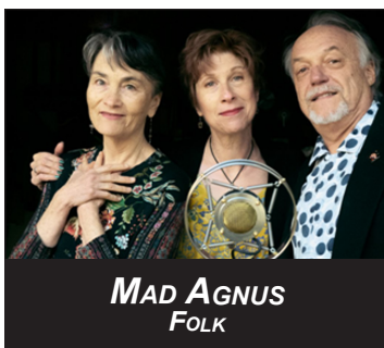
MAD AGNUS FOLK