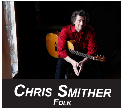
CHRIS SMITHER FOLK