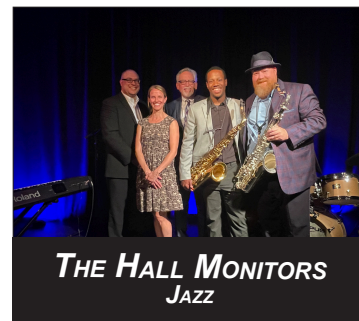
THE HALL MONITORS JAZZ