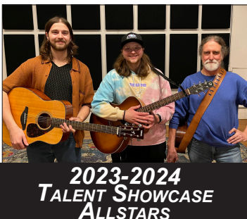
2023-2024 TALENT SHOWCASE ALLSTARS