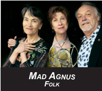
MAD AGNUS FOLK