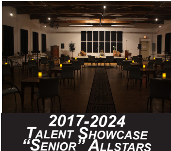
2017-2024 TALENT SHOWCASE "SENIOR" ALLSTARS