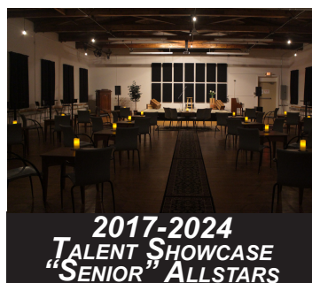
2017-2024 TALENT SHOWCASE "SENIOR" ALLSTARS