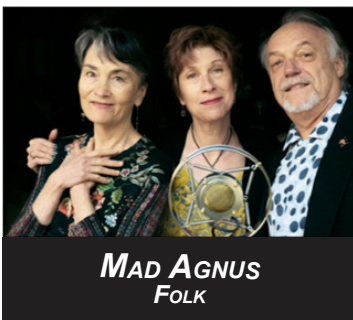
MAD AGNUS FOLK