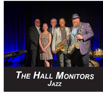
THE HALL MONITORS JAZZ