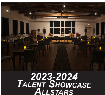
2023-2024 TALENT SHOWCASE ALLSTARS