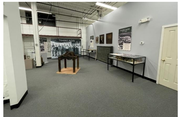
Before & After: A view of one part of the Gardiner Hall Jr. History Museum before the makeover (left) and after the makeover (right).