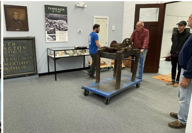
Museum pieces being moved back into the museum after carpeting installation. A final day of planning and layout decisions.

future businesses that occupied the mill, personal items of the Hall family, and relics from employees. More is to come as new pieces are put on display and the museum expands.