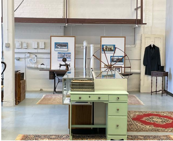
Before: The view from the museum entrance before the makeover. Photo taken in September, 2023 before the former exhibition layout was removed for carpet install.