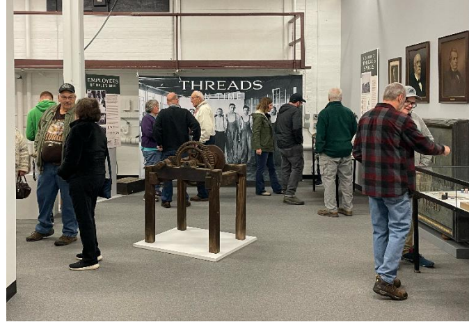
After: The view from the museum entrance after the makeover. Photo taken during the Grand Reopening on December 2, 2023.